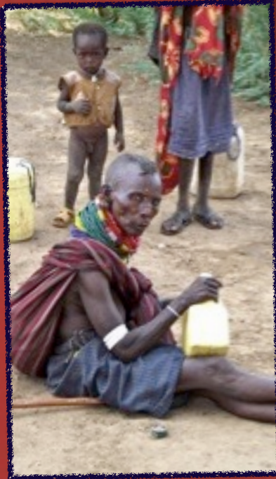
Old woman waiting for water