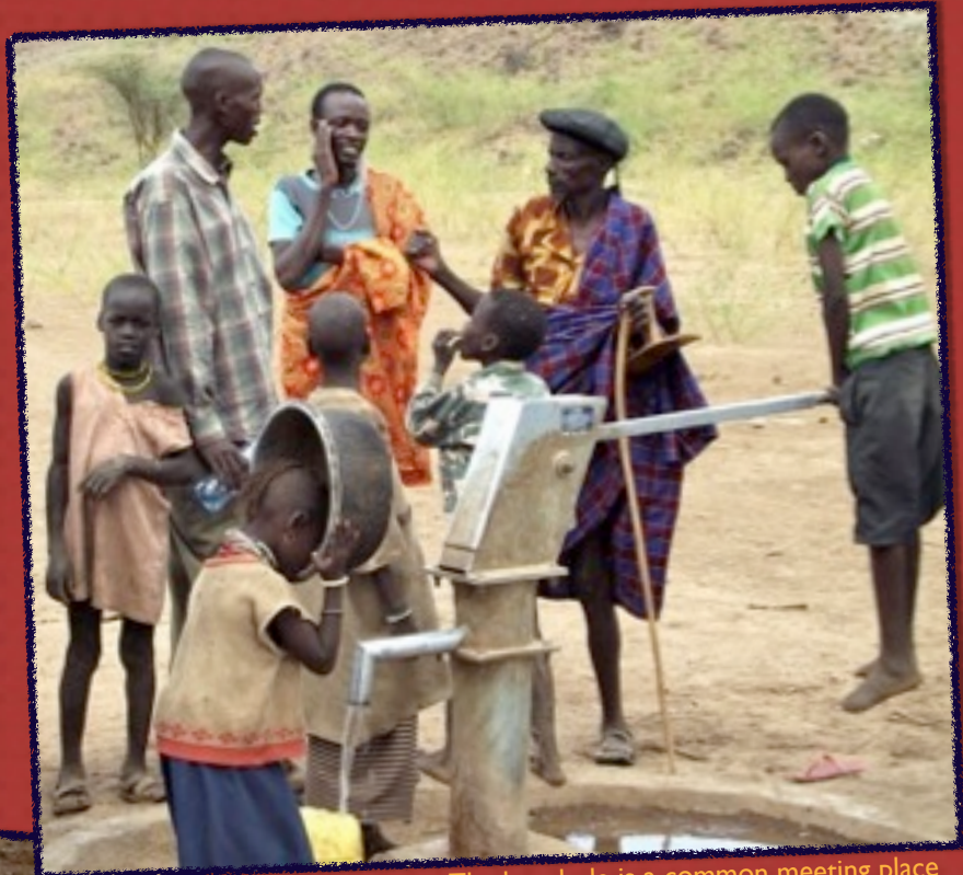
The borehole is a common meeting place